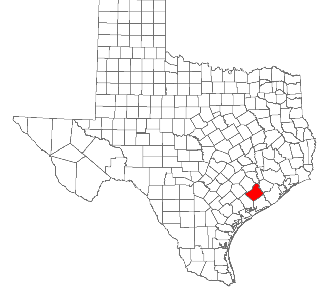
Wharton County, Texas

FINANCED THROUGH THE TEXAS DEPARTMENT OF AGRICULTURE Preparation of this document was financed through provisions of a Texas Community Development Block Grant from the U.S. Department of Housing and Urban Development.