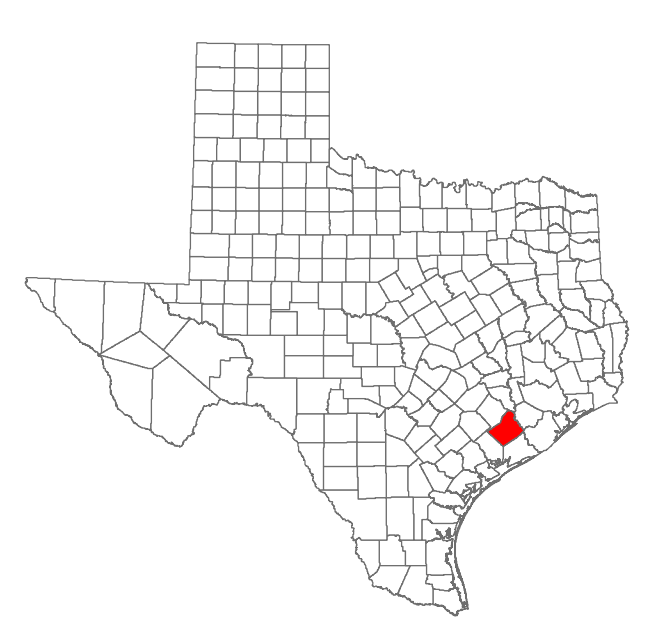
Wharton County, Texas

FINANCED THROUGH THE TEXAS DEPARTMENT OF AGRICULTURE Preparation of this document was financed through provisions of a Texas Community Development Block Grant from the U.S. Department of Housing and Urban Development.