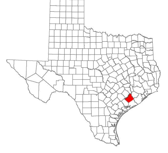
Wharton County, Texas

This illustration was created using the best available data. Subsequent additions, edits, & georectification performed by Grantworks, Inc.