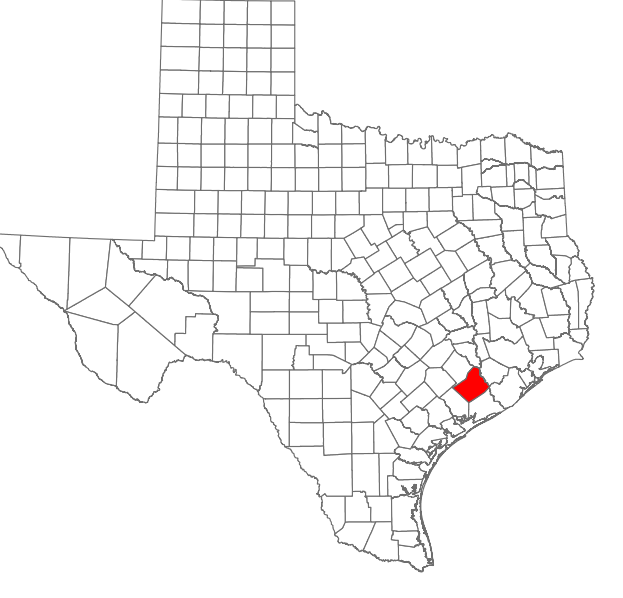
Wharton County, Texas

FINANCED THROUGH THE TEXAS DEPARTMENT OF AGRICULTURE. Preparation of this document was financed through provisions of a Texas Community Development Block Grant from the U.S. Department of Housing and Urban Development.