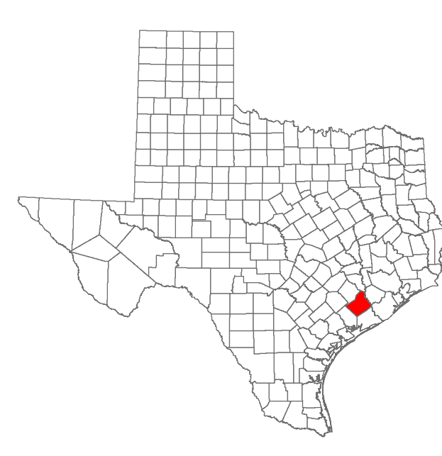
Wharton County, Texas

GrantWorks, Inc. 2201 Northland Drive, Austin, TX 78756 Phone (512) 420-0303 Fax (512) 420-0302